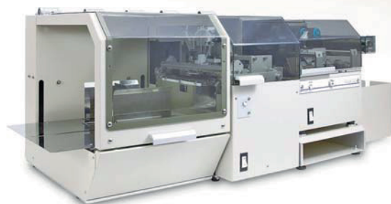
VF601 + THP641 with ionizer